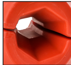
Patented Multi-Faceted Grip-Tite™ Design